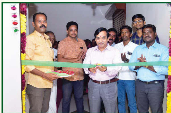
Tindivanam Branch (19.03.2018)