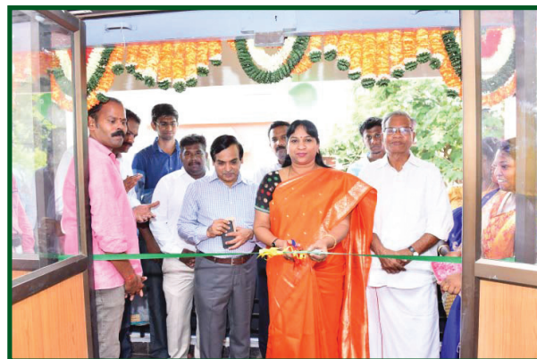
Avadi Branch (31.03.2018)